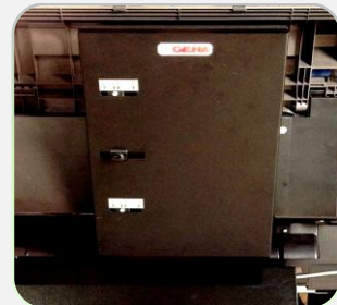
Assisted Cross Fold